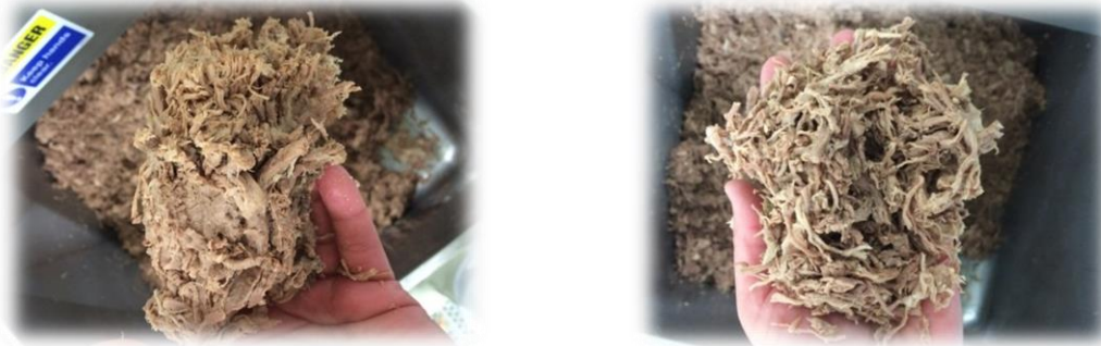
Figure 2 – Impact of Inadequate Cooking of Cold Shredded Beef Shoulder Clods

The product in the left photo was processed to an internal temperature of 180°F (82°C) and held for 3 hours. The product on the right was processed to an internal temperature of 180°F (82°C) and held for 5.5 hours. These photos illustrate the most common failure observed during cold shred processes, inadequate breakdown of collagen during thermal processing. Product on the left still contains large chunks of insolubilized connective tissue/collagen following cooking that continues to hold the muscle fibers together, resulting in an inconsistent shred.